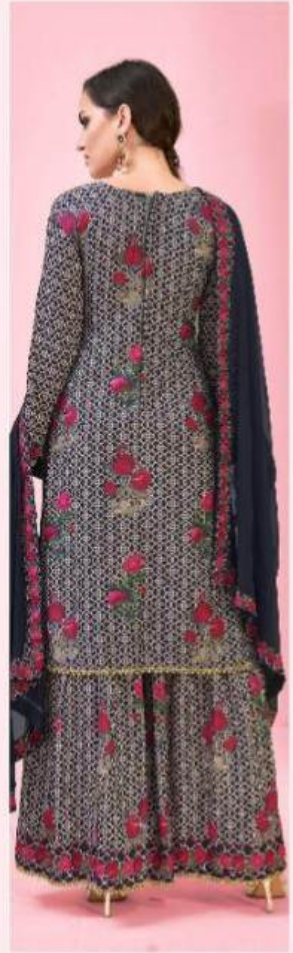
That heavy gives intricate beauty inspired a glimpse of Indian art to walk up the fashion world. The intricate work gives beautiful designs and to woman's for their best pieces.