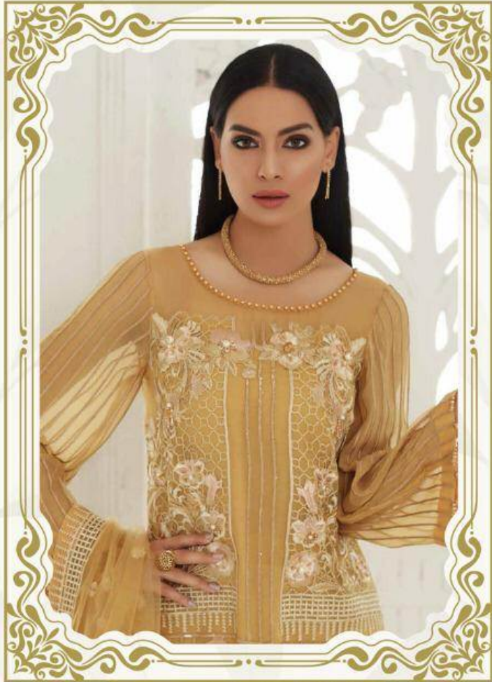
DESIGN /2015 STYLISH AS EVER