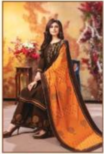
Aitbaar 004 Vol.2