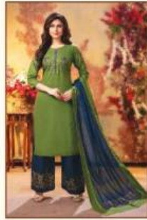
Aitbaar 005 Vol.2