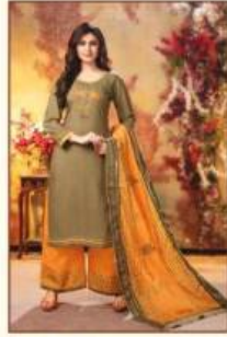
Aitbaar 002 Vol.2