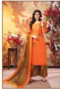
Aitbaar 008 Vol.2