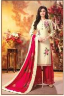
Aitbaar 001 Vol.2