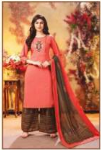
Aitbaar 007 Vol.2