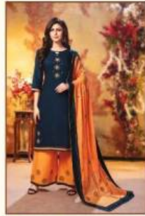
Aitbaar 006 Vol.2