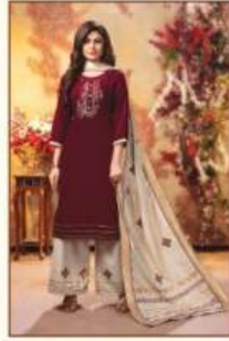
Aitbaar 003 Vol.2