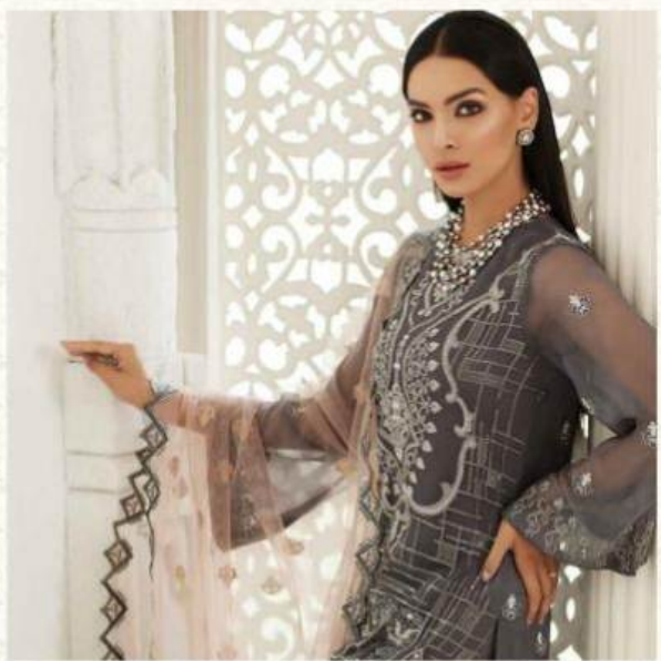
One is never overdressed or underdressed with a little gray dress